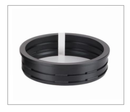
Plastic C-ring for Zoom Gear