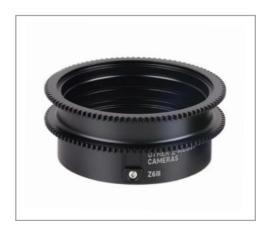
Z2450-Z Zoom Gear